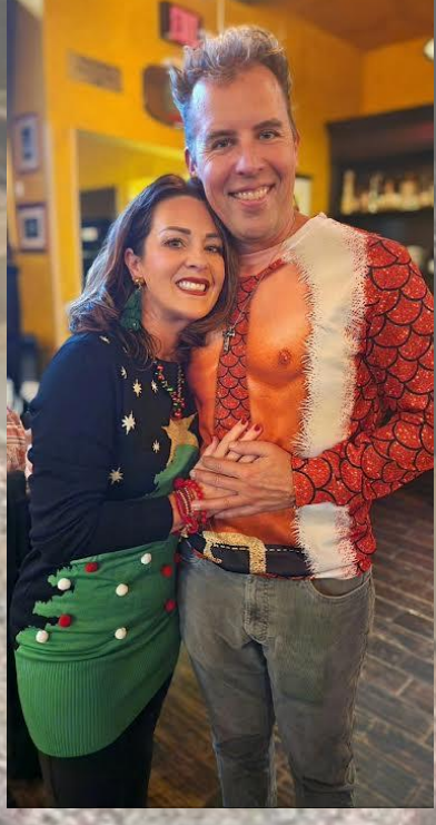
Submitted by Melody Wenger