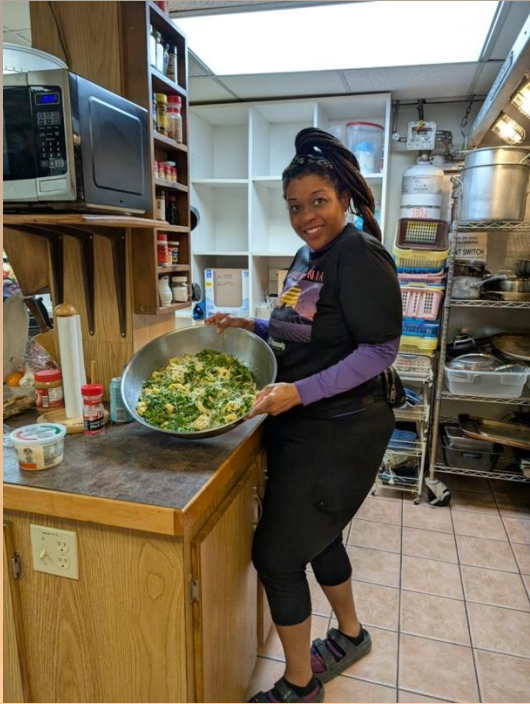
Friday night pulled pork dinner