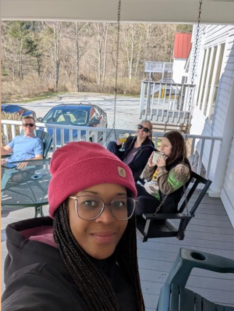
Sunday morning chill session.